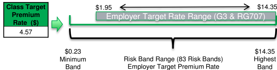
Class G3 - Specialty Trades Construction