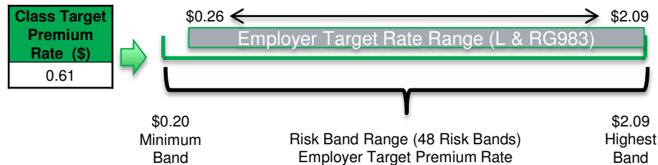
Class L - Information and Culture